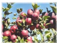
Royal Oak Farm Orchard apples are tree ripened and fresh picked.

Are you looking for a fun way to raise funds for your school, church or other organization? Royal Oak Farm is pleased to offer an attractive program that can help you raise funds for those special projects or operating costs.